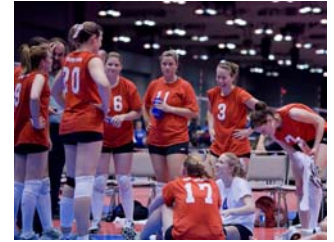
Pretty Betty Women's A Team USAV Nationals